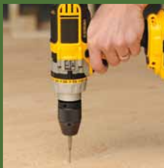
Screw them out.