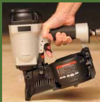
Drive them in.

There's no need for special tools. Most important, there's no slowing down—just load, drive in and go. So join the fastening revolution today with PneuScrew pneumatic fasteners.